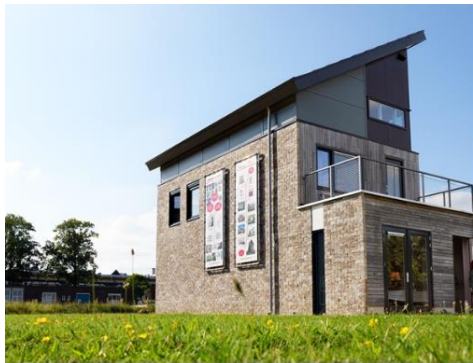
Living Lab Empathic Home

“Empathic Home” is a user-centric living lab proposed by Mohammadi (2020) that seeks to merge physical infrastructure, such as homes, with technological advancements to create a living environment that intuitively responds to and anticipates the inhabitants' needs (Mohammadi, 2020). This living lab, with a three-story structure and a ground floor area of approximately 65 square meters, is situated within the IPKW industrial park in Arnhem, The Netherlands (Lieshout, 2023) (Figure 1, left). The Empathic Home venture has yielded effective POCs for implementing empathetic living environments. One such POC is the Guiding Environment, which supports independently living seniors with dementia with General Daily Activities (GDA), such as circadian rhythm, at their home environments (Grave, 2019). Within the Empathic Home living lab, these POCs often incorporate technological components, such as IoT sensor networks, intelligent user interfaces, and adaptable environmental controls to maintain and increase the autonomy of older adults in their living environment.