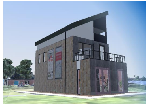
Digital Twin Empathic Home (VR-enabled)